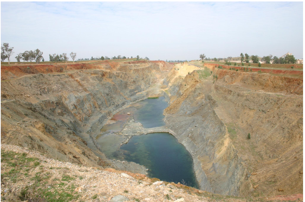
Photo E.3-1 Former gold mine site near Parkes

Another option raised in public forums has been the possible use of the old sale yards site siding for a waste facility, to transport waste from Orange on this rail link to an unspecified site near a rail line. Without knowing the distances involved, it is reasonable to say that the challenges and costs would be similar to the Woodlawn rail option discussed above.