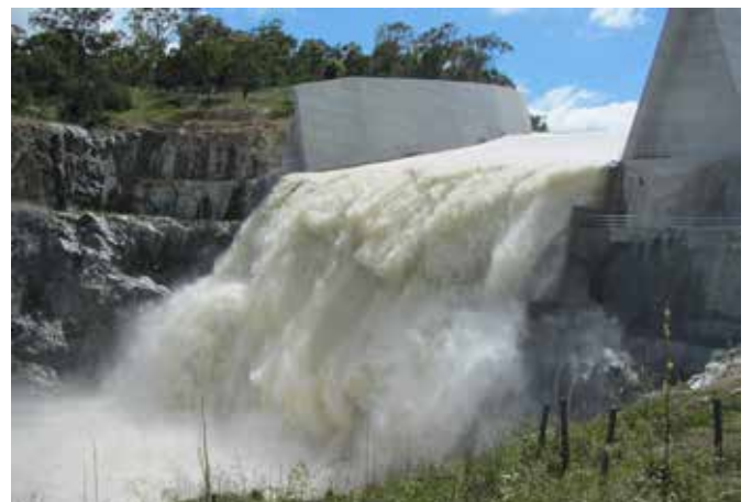
Cover page: Enlarged Cotter Dam, Canberra (Courtesy of Bulk Water Alliance); Above left: Eildon Dam; Above right: Googong Dam Spillway Upgrade, Canberra (Courtesy of Bulk Water Alliance)